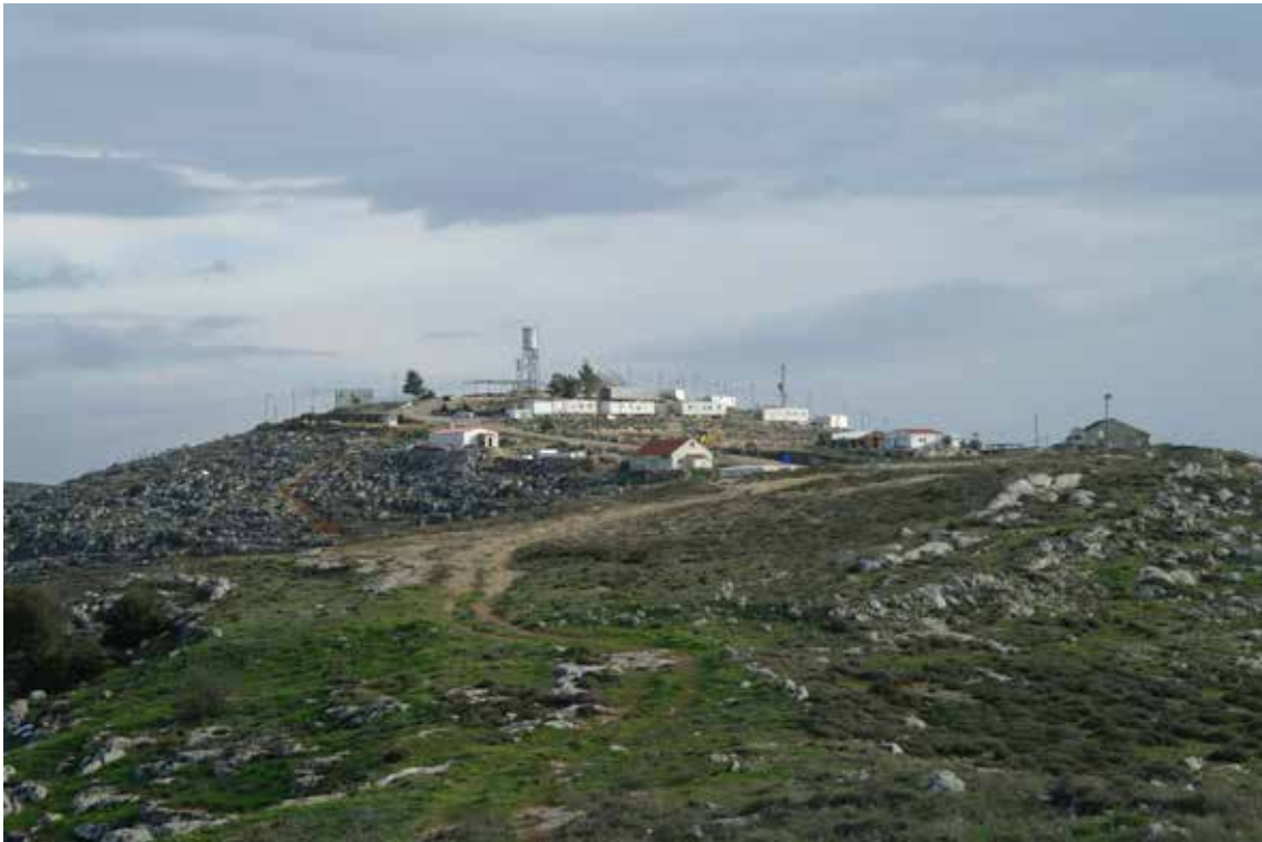
Ahiya outpost as seen from Jalud, January 15, 2015.

One symptom of Jalud's impoverished economic situation in the last decade is a sharp decline in the village's population, from 1000 residents in the late 1990s to approximately 600 today. According to the head of the village council, most of those who emigrated are young people who moved to nearby West Bank cities in pursuit of employment.